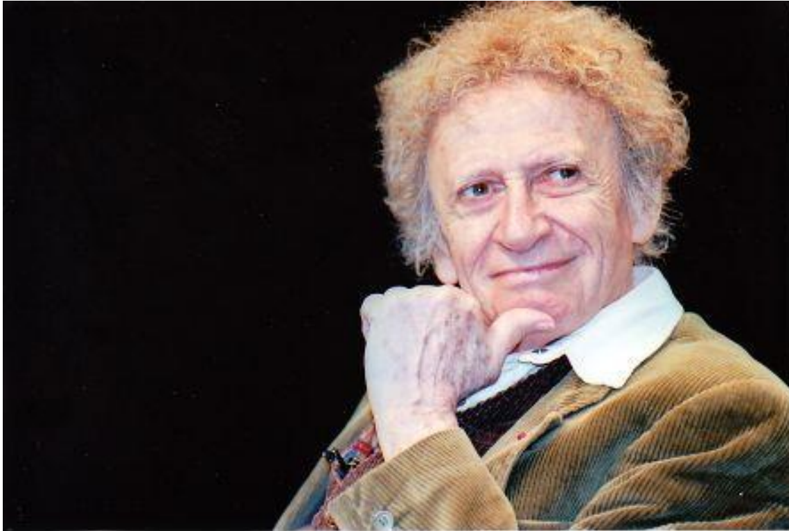
Photo: Marcel Marceau in residence at OSU, © OSU Photo Services 2001